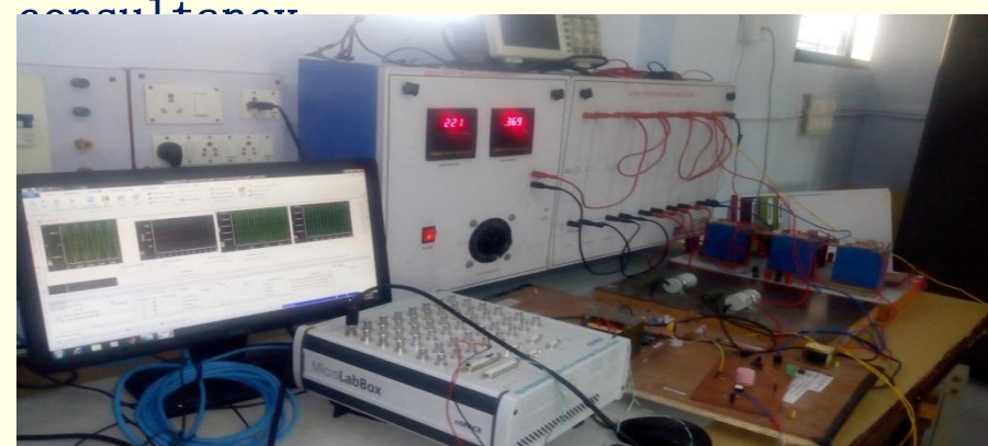
Only Institute in Nashik to have Microlab dSPACE for rapid simulation & prototyping