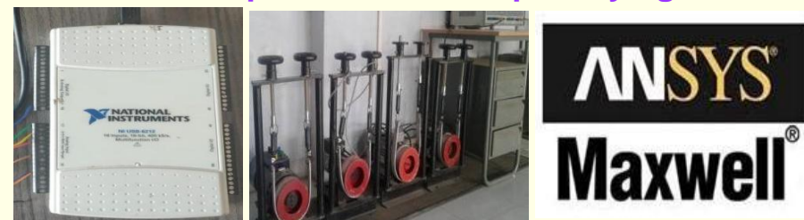
NI-DAQ CARD For Signal Acquisition