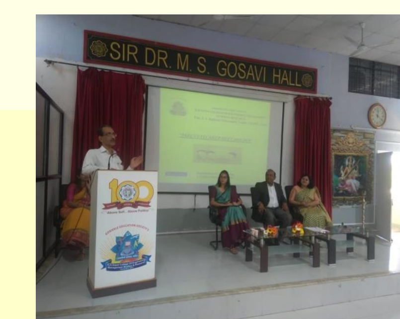
Parents Teachers Meet