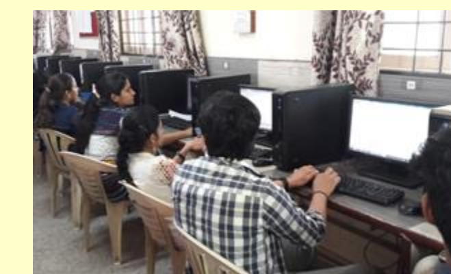
Task Based Learning