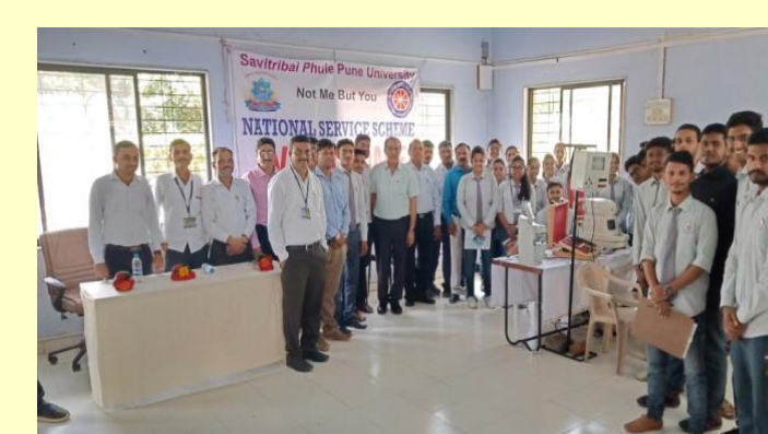
NSS Blood Donation Camp